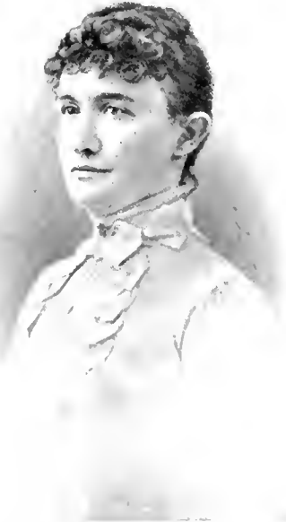
MARY NOAILLES MURFREE.

MURFREE, Miss Mary Noailles , novelist, born in Grantlands, near Murfreesborough, Tenn.,